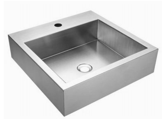
Model ASC1818-1 Illustrated